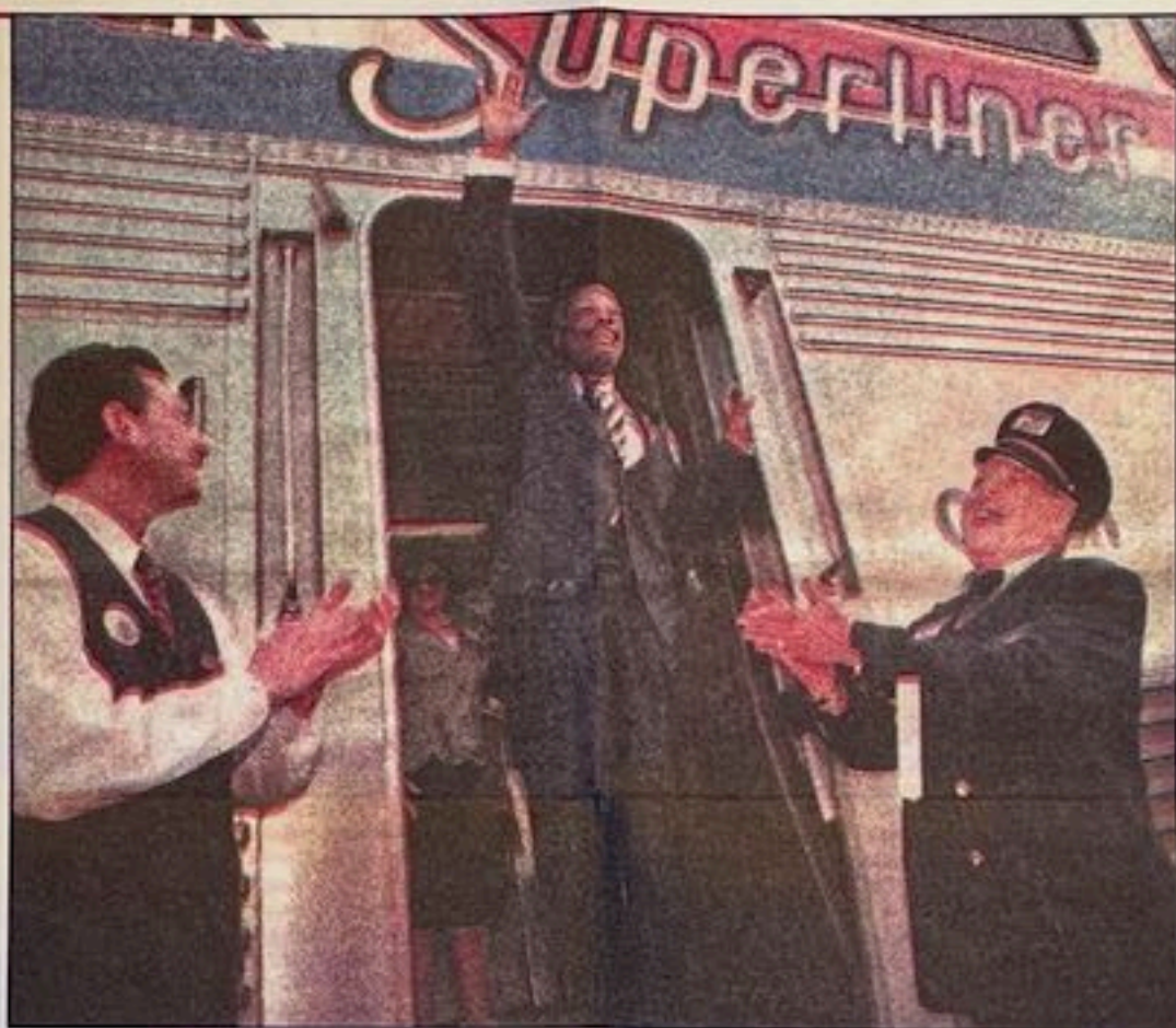
San Francisco Mayor Willie L. Brown, Jr. steps off the first Amtrak train arriving in San Francisco's new Downtown Transportation Center Station. With construction of the station Brown has built a project that has been planned for over 100 years.

opened-up over 40 acres for development. Bringing together all the Bay Area's transit services spawned new office, retail and hotel construction around the new station, including several office buildings approved during the 1980's.