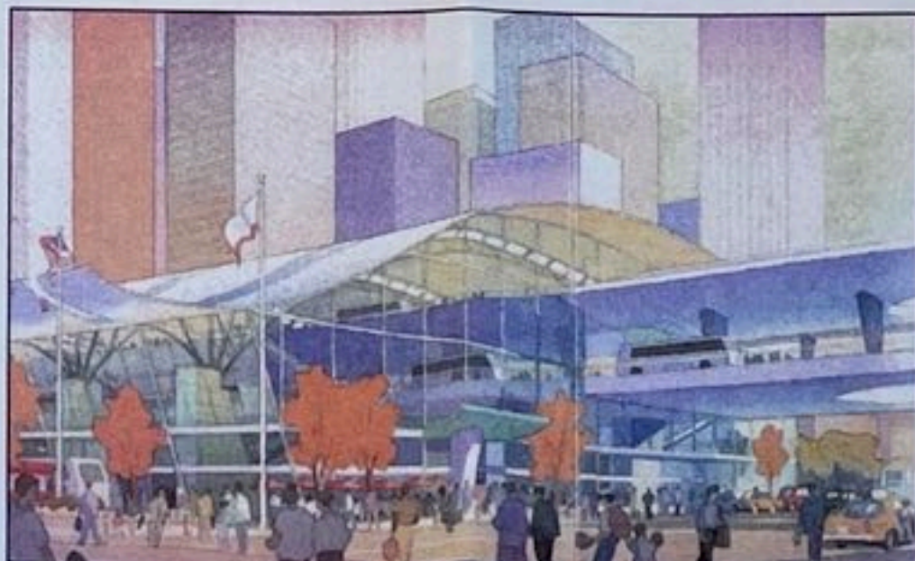
New CalTrain Downtown Transportation Center keeps Bay Area commuters and ballpark goers moving in and out of downtown S.F. rapidly.