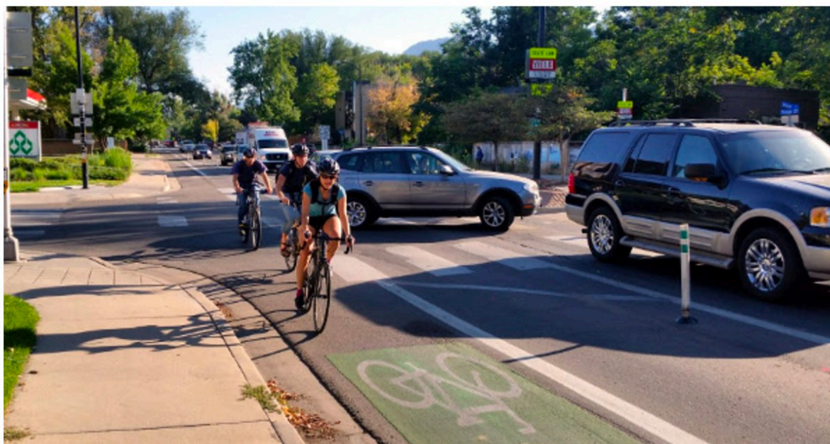
Boulder's Folsom Street on Friday afternoon.