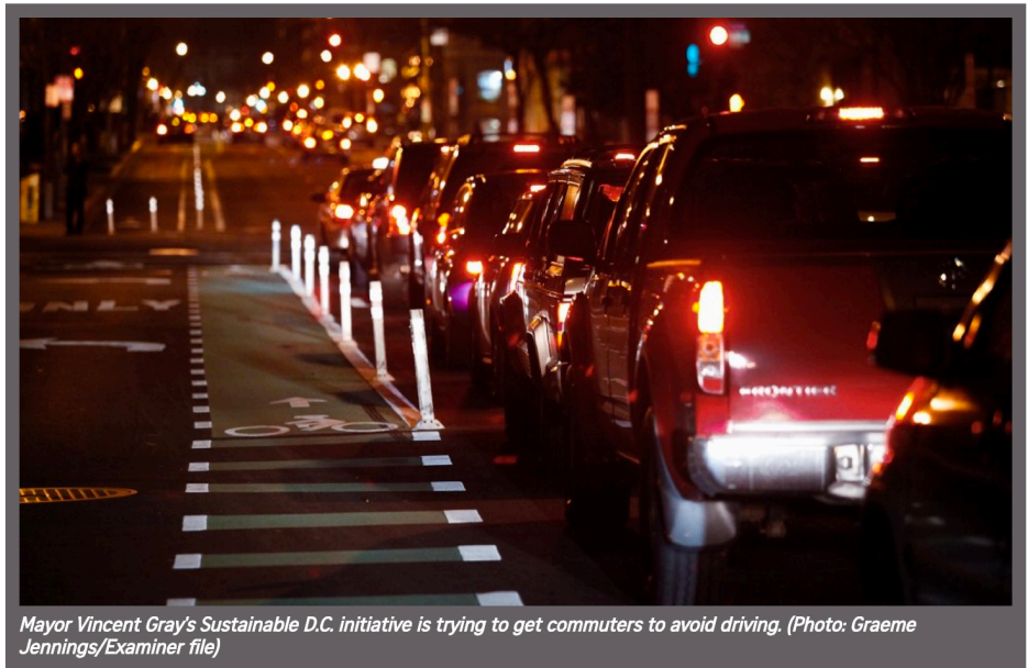
Mayor Vincent Gray's Sustainable D.C. initiative is trying to get commuters to avoid driving.