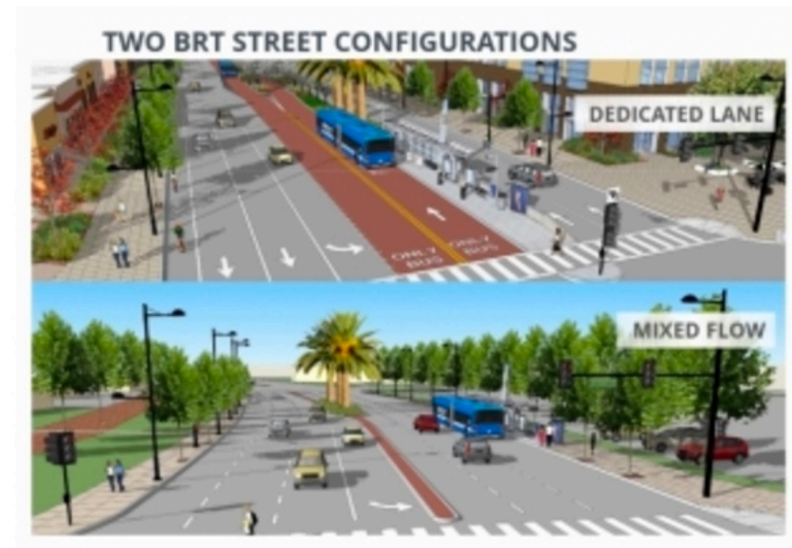
A rendering of the two street configurations: a 'dedicated-lane' proposal versus a 'mixed-flow curb lane.' Rendering courtesy of the city of Palo Alto.

To reassure the critics and add credence to its own analysis of what is known as Bus Rapid Transit (BRT), the Santa Clara Valley Transportation Authority (VTA) on Tuesday released a new independent review that the